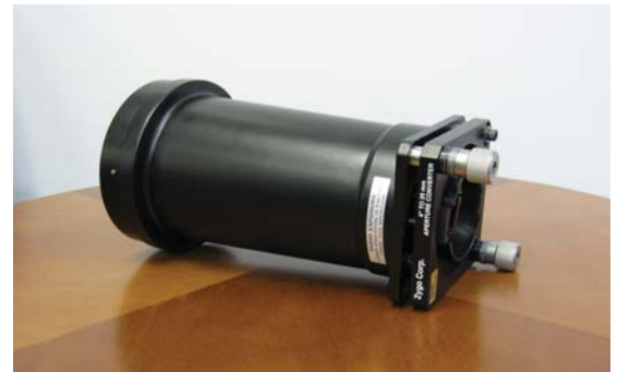
New hardware options include transmission elements and an aperture converter, allowing you to harness even more power from your SSI-A.

If you need Aspheric Metrology, learn more about the new SSI-A. We think you'll be impressed.